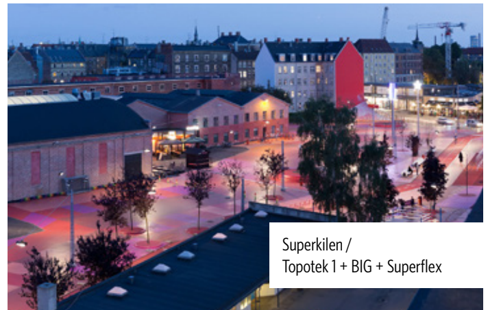
Superkilen / Topotek 1 + BIG + Superflex