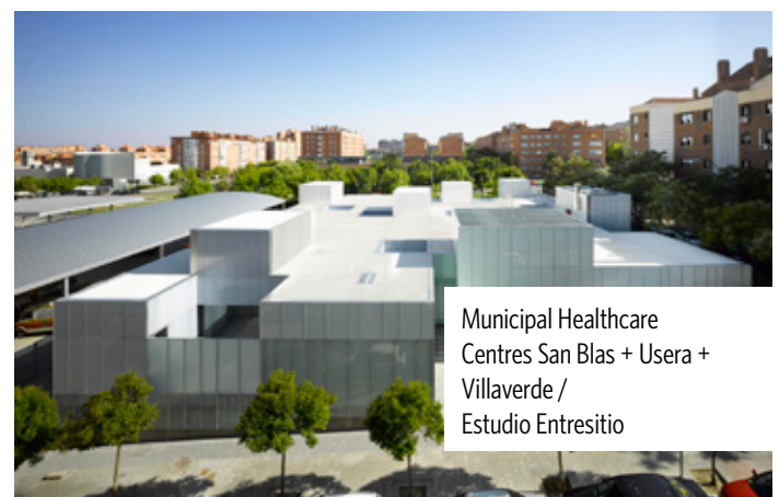
Municipal Healthcare Centres San Blas + Usera + Villaverde / Estudio Entresitio