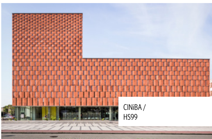
CINIBA / HS99