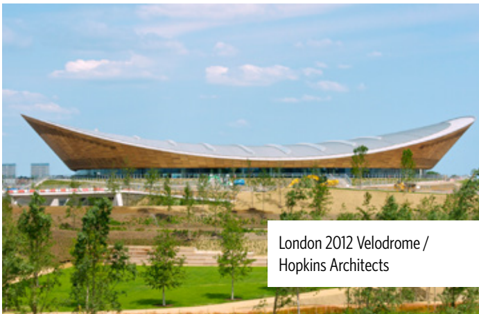
London 2012 Velodrome / Hopkins Architects