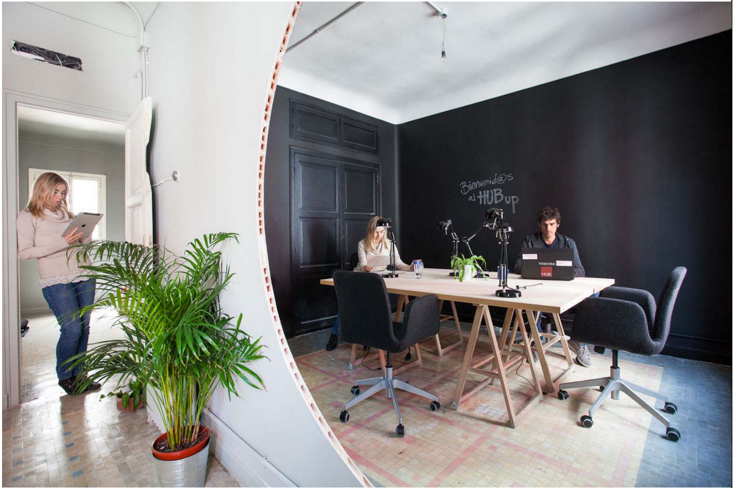
ch+qs Churtichaga+Quadra-Salcedo arquitectos, HUB flat, Madrid. Top: Photo © Elena Almagro. Above: Photo © Daniel Torrelló

Two virtual spheres and a big virtual cone has been used to transform the space in such a way that a new landscape of situations appears. The project has been developed drawing with Sketchup in order to analyze the way to cross the whole space allowing visions “fugues” and surprising situations.